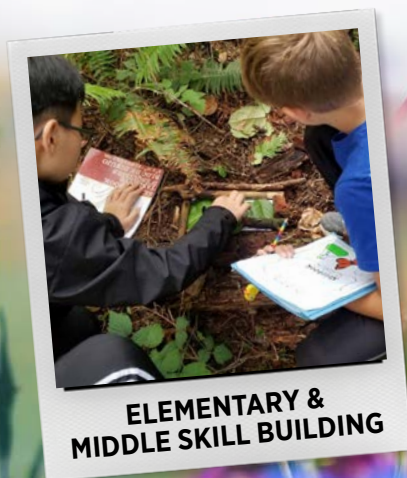
ELEMENTARY & MIDDLE SKILL BUILDING